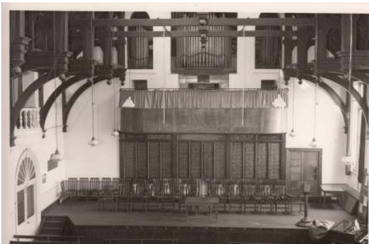
The Great Hall, Alleyn's School