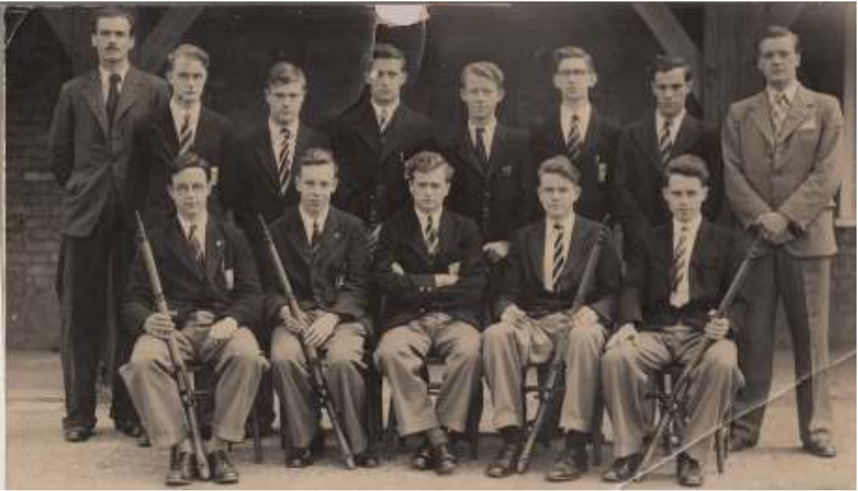
Shooting Team, 1948