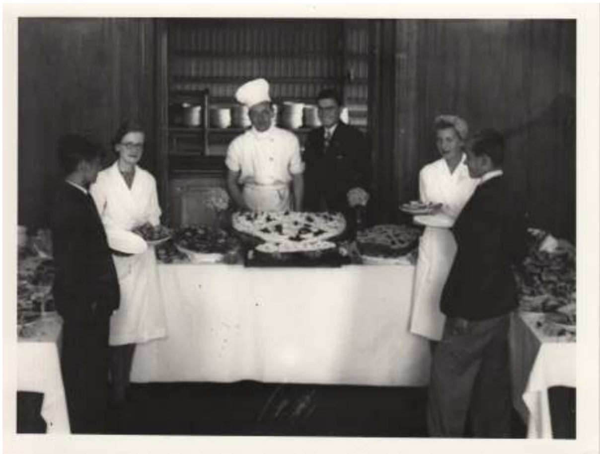
Cake in shape of crest, Lammas Term, Rossall, 1944