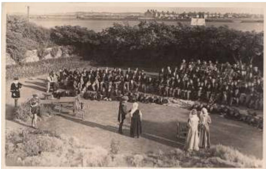
Twelfth Night at Rossall