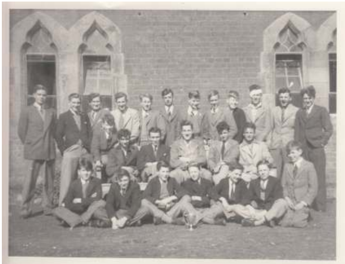
Possibly Crescent House