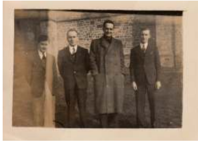
International Forum, Rossall, 1943