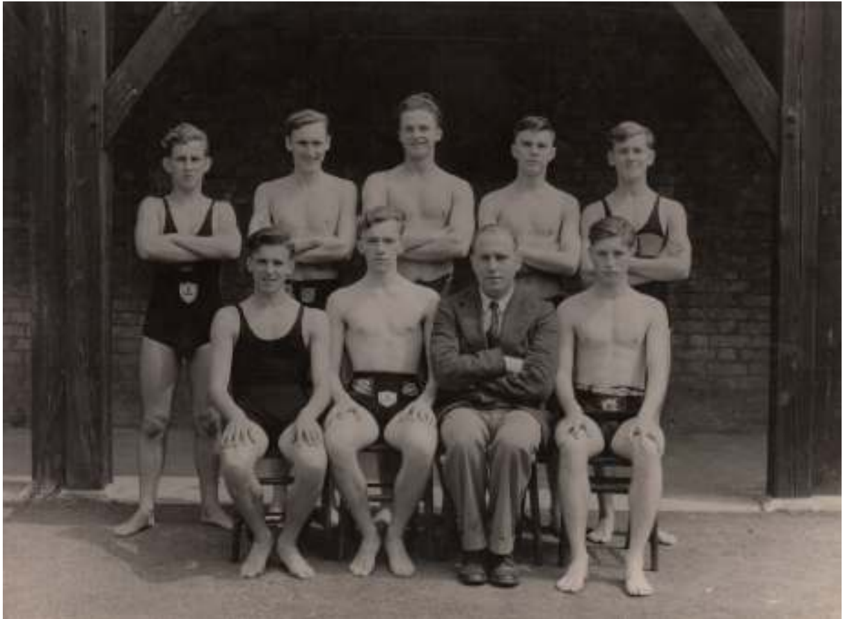
Swimming Team, 1946