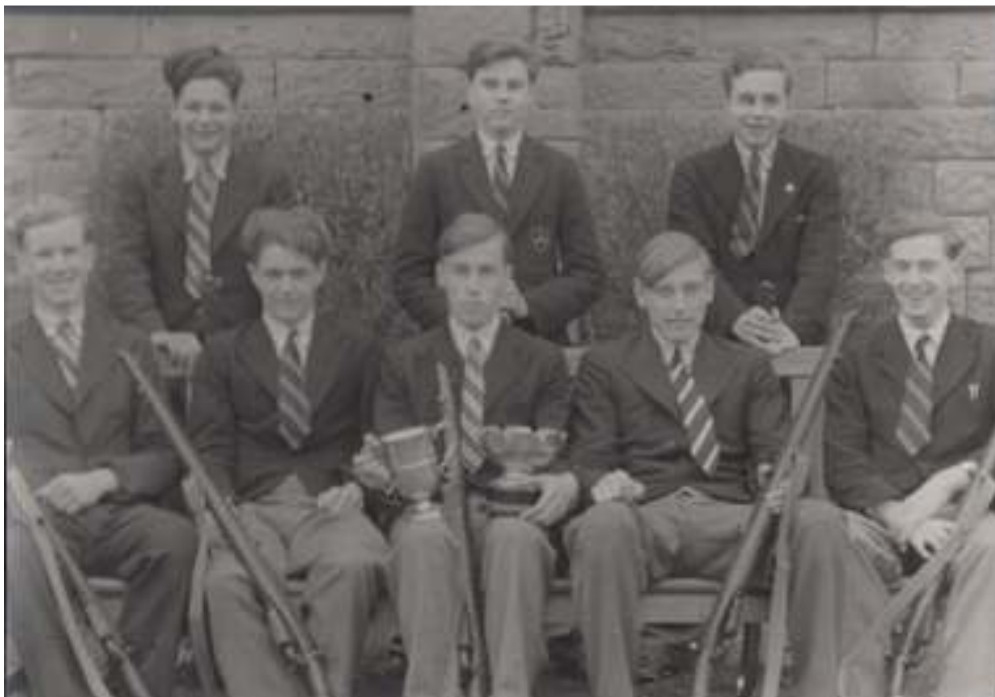
Shooting Team, 1944