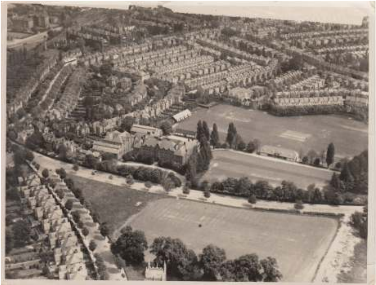
Aerial shot of Alleyn's, c.1935