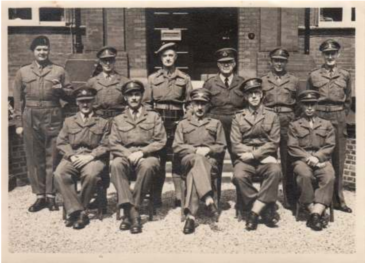
CCF officers, Alleyn's School, no date