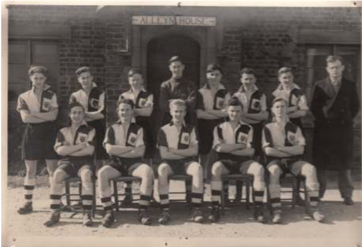
Football at Rossall