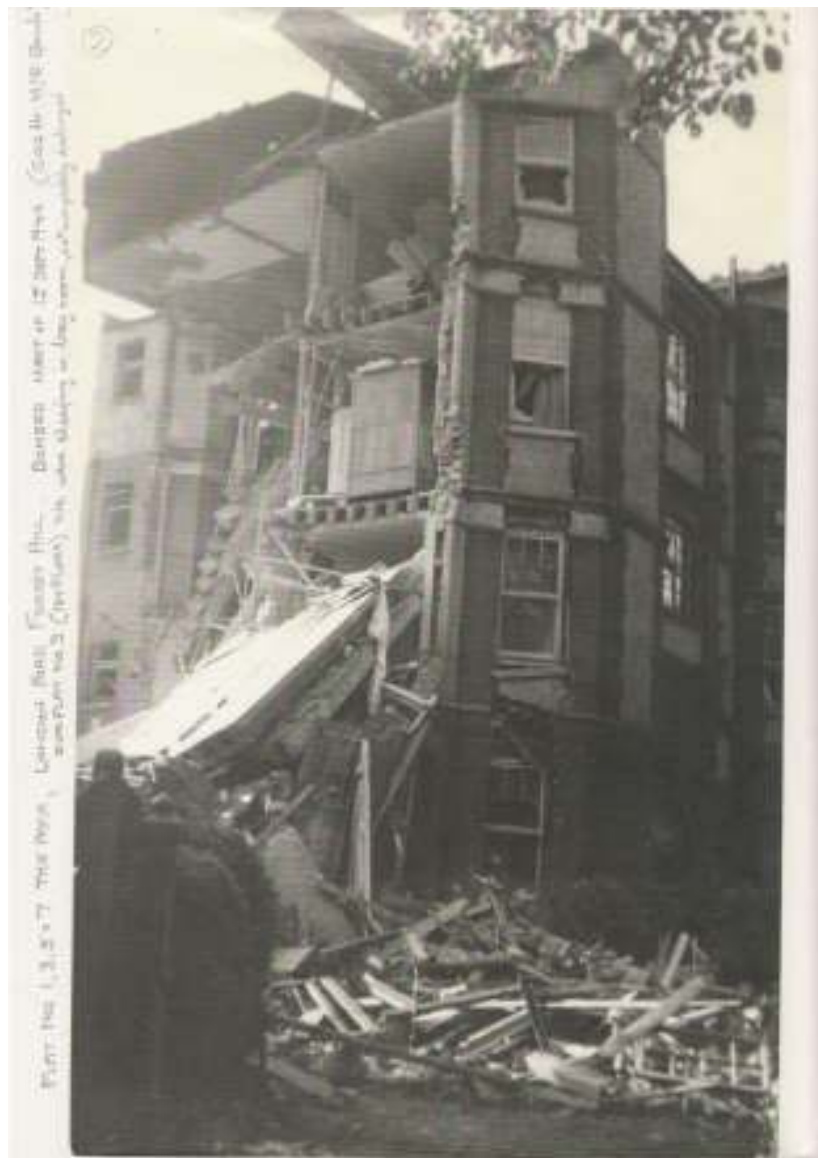
Remains of Ian and Derek Smith's bombed-out flat, London Road, Forest Hill