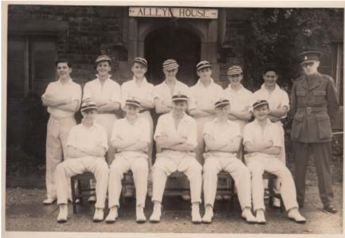
Cricket 1 st XI, 1944