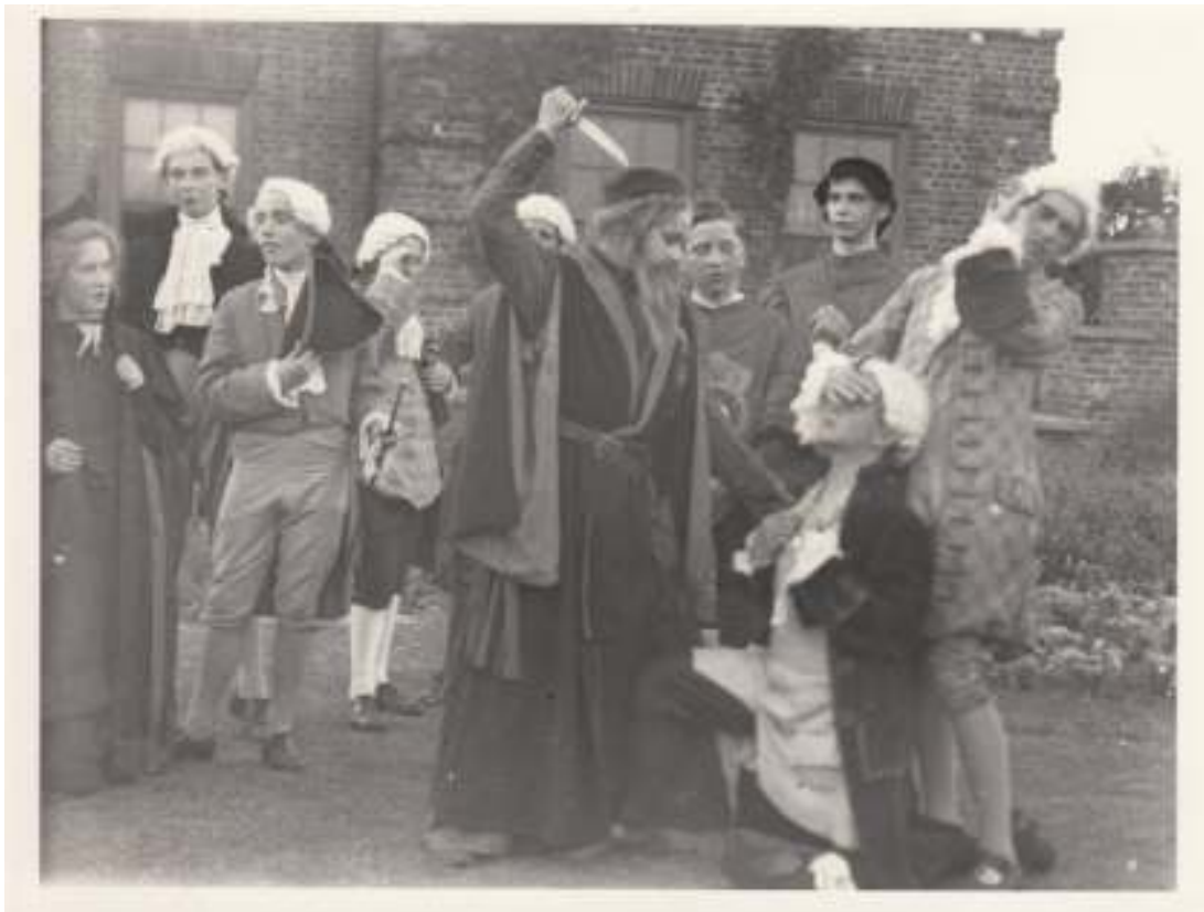
Drama at Rossall