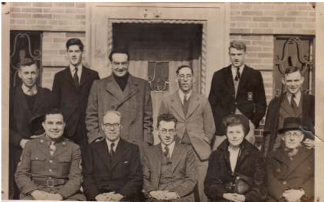
International Forum, Rossall, 1943