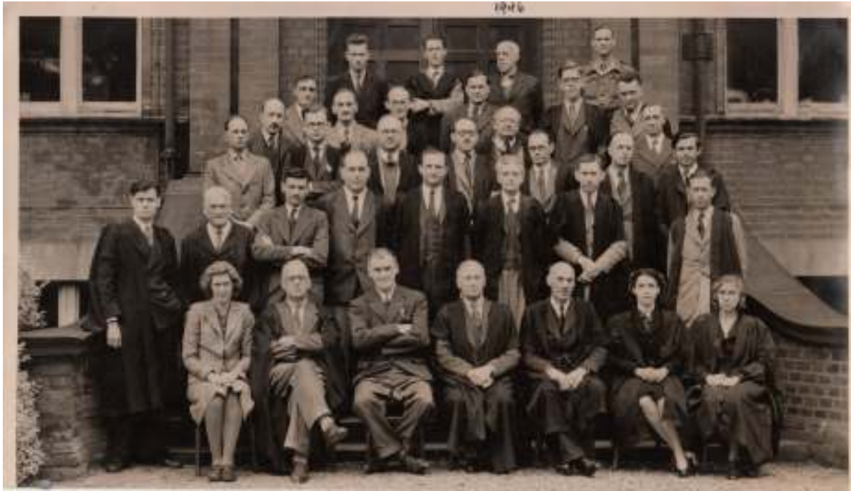
Alleyn's staff, 1946