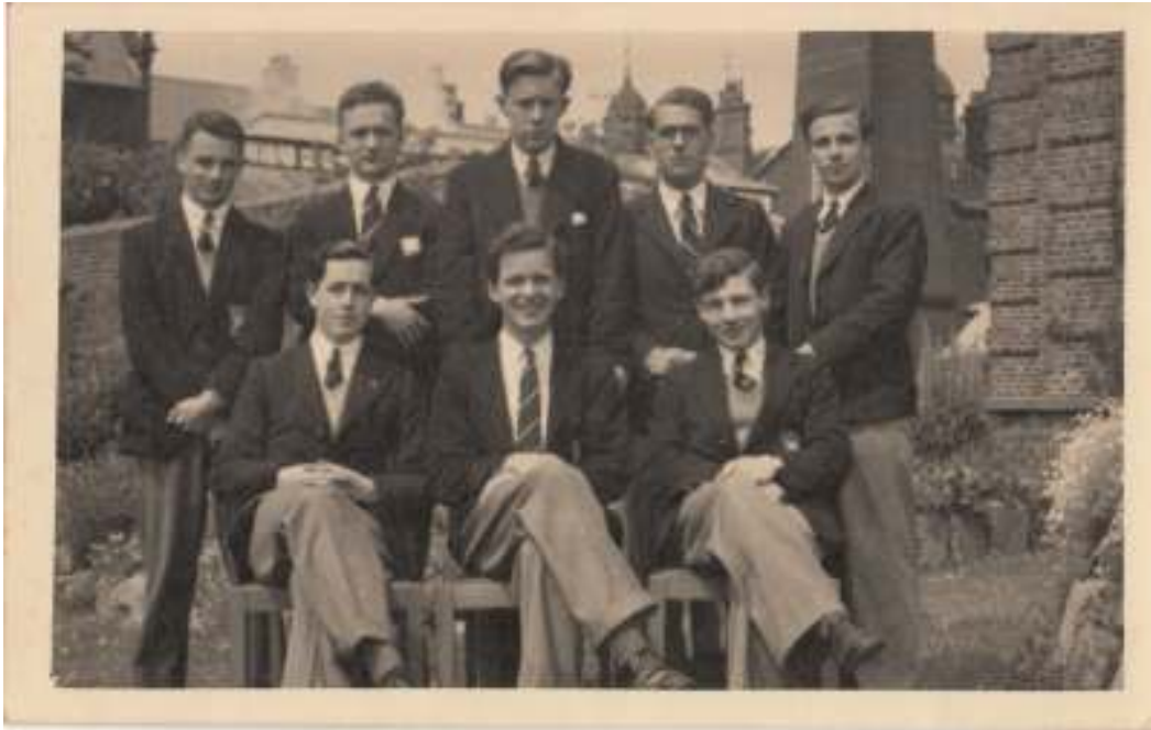
Rossall, July 1941