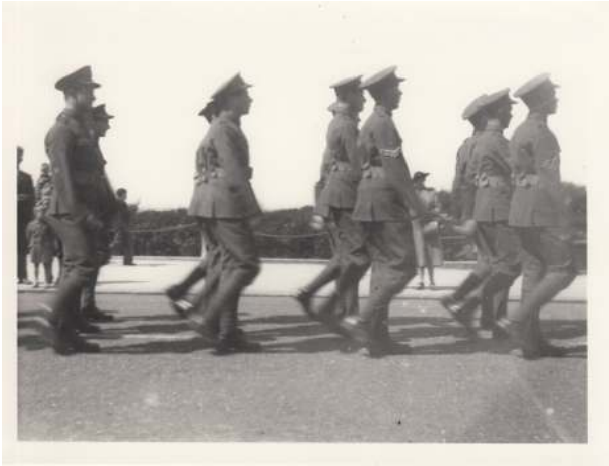
JTC Parade, Fleetwood