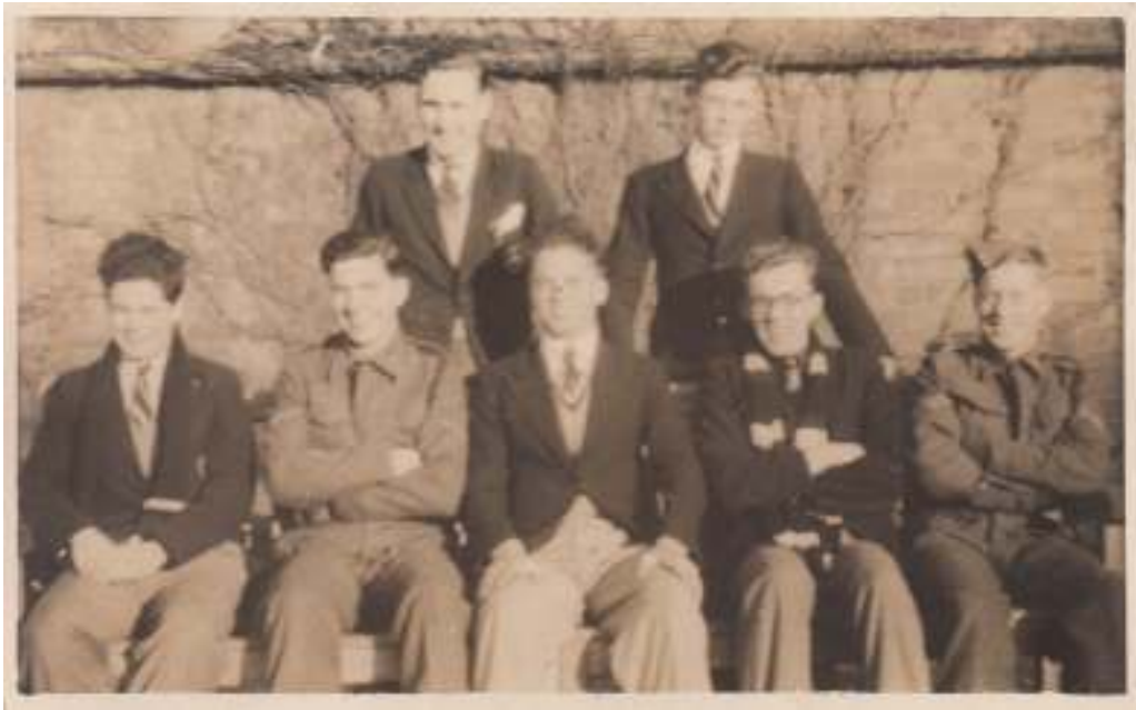
Crescent House (winning) Football Team