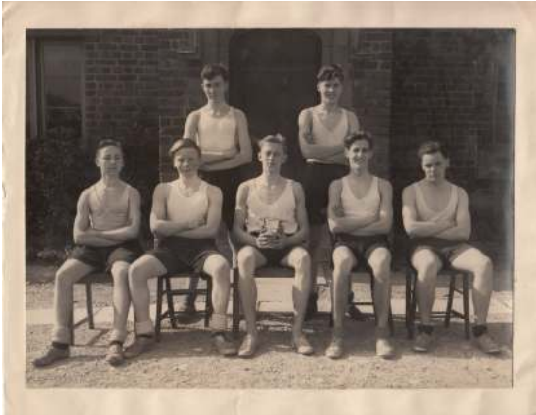
Spread Eagle Cross Country Team, 1941 or '42