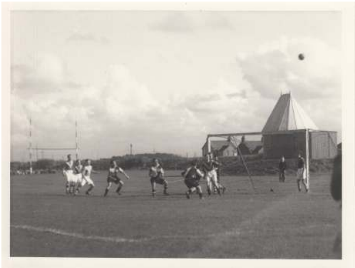
Football at Rossall, on the pitch near the Observatory